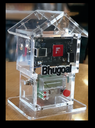
Bhugoal A weather prediction device

We are one-stop facility for all these regulirements