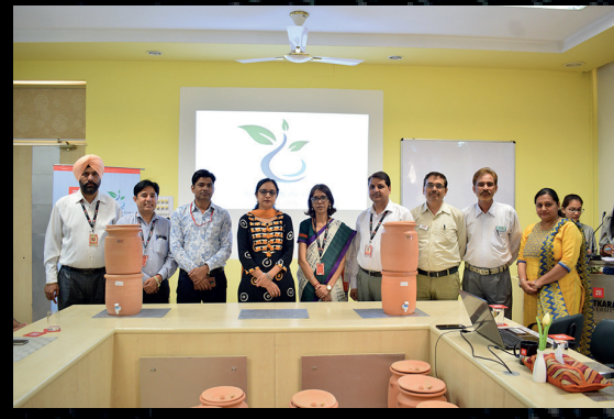
SwachhNeer Water purification system

We are one-stop facility for all these regulirements