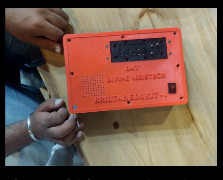
Briltab Edukit Educational kit for visually impaired